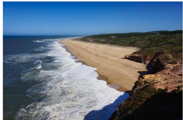
Albania and Portugal are Trend Destinations in 2024