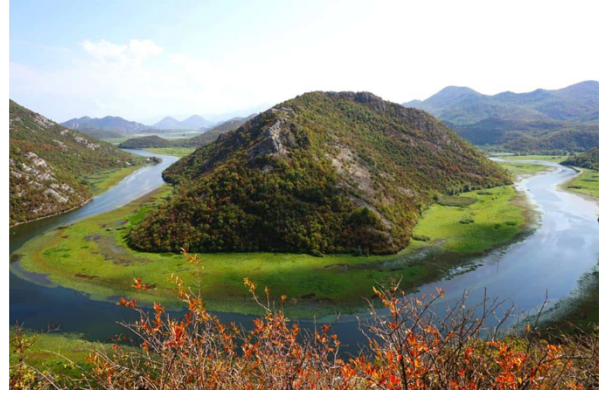
Croatia and Montenegro are Trend Destinations in Europe in 2024

Portugal is also far ahead as a trend destination in this question and is represented twice. As a country (2nd place, 56 points) and as the autonomous region of Madeira (8th place, 27 points).