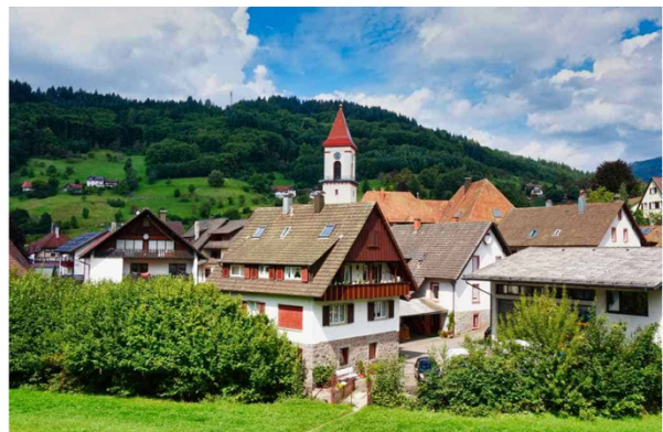
Leipzig and the Black Forest are amongst the Top 10 Trend Destinations within Germany